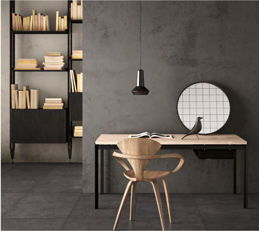
ABOVE Floor: 3PPK101