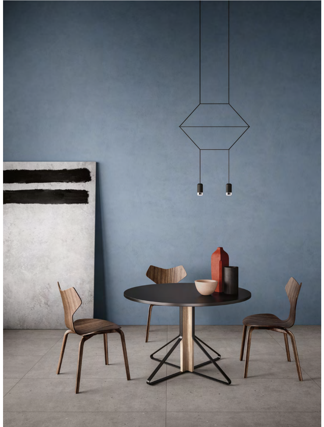
RIGHT Floor: 3PPK102