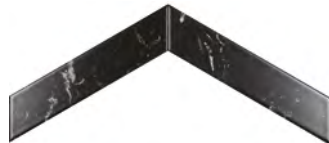
Harlen * 5ACH108