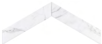
Ionic * 5ACH109